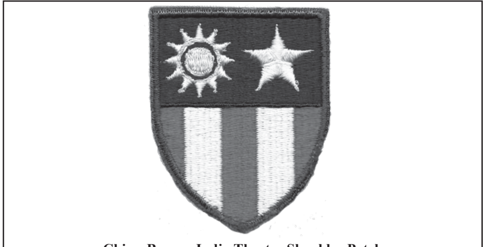
China-Burma-India Theater Shoulder Patch

In a press conference back in Delhi, Gen. Stilwell said, “All retreats are ignominious as hell. I claim we got a hell of a beating. We got run out of Burma, and it is humiliating as hell. I think we ought to find out what caused it, go back, and retake it.”