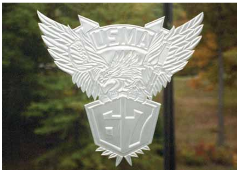
West Point Class of 1967 Crest

To all American Warriors, male and female, who have and continue to proudly serve our nation, and to the author's 29 West Point classmates who made the ultimate sacrifice in Vietnam.